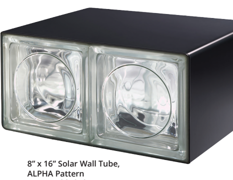
(92% visible light transmission)