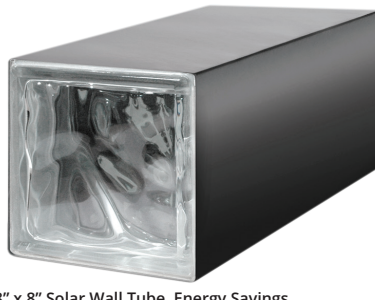
8" x 8" Solar Wall Tube, Energy Savings NUBIO Pattern (63% visible light transmission)