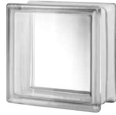
4" PREMIERE™ SERIES