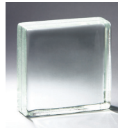
Laminated VISTABRIK® CLEAR